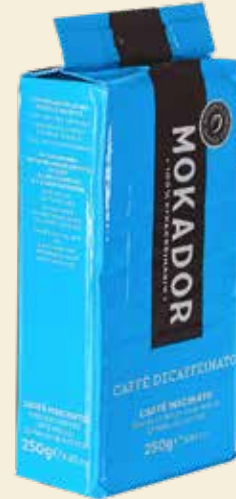
DECAFFEINATED GROUND COFFEE